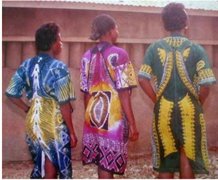
Fig., 1: T-shirt and Mercerized cotton jointly designed in a combination of Tie & Dye and batik