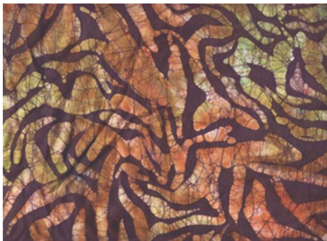
Fig., 7: Final product of a Marbling T-shirt dyeing via the table spoon

Dewaxing was done by melting the wax off the T-shirt surfaces. In order to make this happen, a big basin of water was boiled. Usually this was done over an open fire pit, but other means of heating the water would suffice. The T-shirt fabrics with wax were submerged into the hot water, turned several times and quickly pulled out into the cold water basin to the left over wax to drip off completely after washing. The mechanical finishing operation, other than preparation and colouring, carried out improved upon the appearance and usefulness of the T-shirt after it was dewaxed, washed in an alkaline solution, dried and given an ironing treatment to complete the fixation process. (Fig., 7 & 8) This rendered the resultant products to attain wash and light fastness.