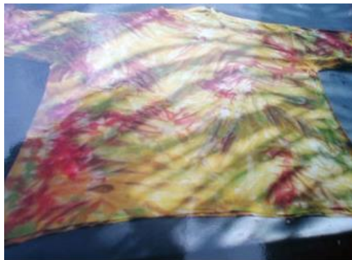
Fig., 4: End product of a Marbling T-shirt dyeing via the table spoon

The two dye mixture ratios, labelled (A and B) were used as shown in Table 1 for all dyes (red, lemon green, and brown) applied for each T-shirt. Mixture A and B used the same ratio for each T-shirt fabric; 5 grams of powdered dye, 10 grams of sodium hydrosulphite and 10 grams of sodium hydroxide. The only difference between them was the quantity of water added after mixing Mixture A which was 0.5 litre of water and virtually maintaining the normal proportion of water enough to dissolve the ingredients in the preparation for Mixture B with only an addition of 29.58 ml of water after preparation (Table 1).