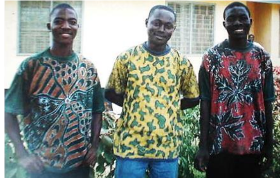
Fig., 2: A Designed T-shirt in purely batik

T-shirt batik making in Ghana, plays an important role as an art form, a useful Friday-wearable fabric, and a means of work for many youth and are seen as a growing significant culture phenomenon well known for its quality and intricate designs.