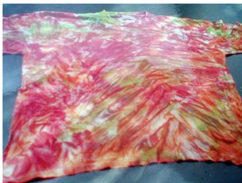
Fig., 5: End product of a Marbling T-shirt dyeing via the syringe

The next stage was to prepare the marbled T-shirt by inserting a cut-out plywood slate that fit perfectly into the T-Shirt as the melted wax on a controlled stove was made ready. A tjanting tool made of foam (Fig., 6) that works almost the same as a real metal tjanting tool was used to draw over the pencil or pen outlines design on the T-shirt (note that any motif can be drawn using a 6B pencil before waxing). The melted wax was picked with the tjanting tool and applied as desired based on the drawings on the T-Shirt. (Fig., 6) As the waxing progressed, the composition was refined. Areas intended to display the background marbled colour of the T-shirt were covered with wax. The moderately hot wax used was to avoid the spread of the melted wax into undesired areas of the T-shirt. To achieve the perfect temperature of the melted wax demands practice. After the completed images, the tissue was submerged into a dye bath set at pH 6 in a similar dyeing procedure used for mercerized cotton fabric.