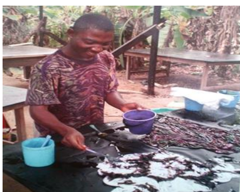
Fig., 3: T-shirts Marbling and dyeing on a table top

For this study, two new cotton T-shirts weighing 135 grams each were immersed in cold water for 2 minutes and removed onto the working table without squeezing out the water from the T-shirts. This was very important because the essence of the results depends on it. The wet T-shirts were immediately marbled by gathering them separately to form loose circular shapes on the working table (Fig., 3). The prepared vat dyes were then gradually distributed on the wet T-shirts with the help of a syringe per each colour dye for the first T-shirt and the use of the tablespoon per each colour dye for the second T-shirt. (Fig., 3)