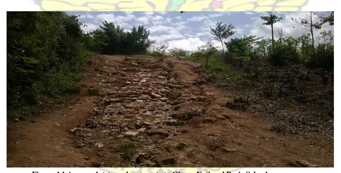
Figure 4.1 Approach (steep slope) route to Ghana National Basic School

Comparatively, the selected non-inclusive schools had a better approach route than the inclusive schools. This should not be the case especially with inclusive school being the appropriate destination for pupils with disabilities. The construction of the route should be guided by the view that pupils with or without disabilities have varied degrees of capabilities