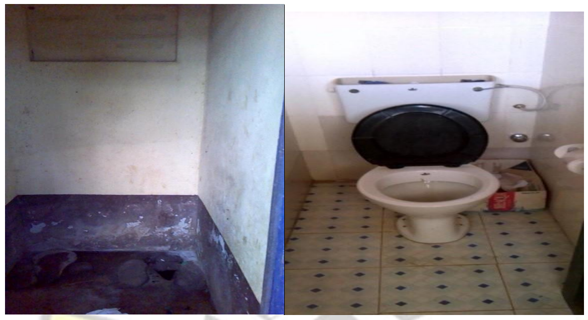
Figure 4.4 Pit Latrine at Ghana National Basic

Due to the seriousness of the situation observed in the schools, stakeholders must take the necessary steps to remedy the situation.