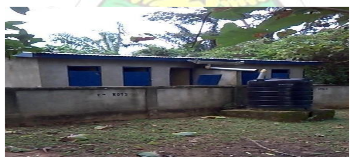
Figure 4.6 Broken doors to toilet facility at St Anthonys Basic

In the non- inclusive schools, .E.J.P Brown Basic, Kakumdo Basic and Ayifua St. Mary's Basic ensured the privacy of it pupils by providing separate facilities for boys and girls and in addition had inside locks that pupils used the facility without interferences. Efutu basic on the other hand had two pits in a cubicle breeching the privacy of pupils. The pupils of St. Lawrence had no facility in the school and therefor used a public facility with no doors. However, construction of new classroom blocks on the school premise had provisions of toilet facilities which when completed will alleviate this current problem. Comparatively, the inclusive schools had toilet facilities that ensured the privacy of it pupils than in the non-inclusive schools.