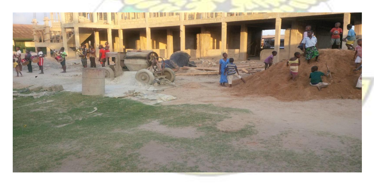
Figure 4.3 An obstructed circulation route at St Lawrence Basic

Comparatively, the seven inclusive schools had an appropriate circulation route than the selected non inclusive schools. However, the circulation route should be given the necessary attention, as this enables pupils to familiarize as well as participate in school activities. To avoid confining pupils to the classroom in the fear of endangering themselves, the necessary modifications or reconstructions must be expedited with urgency.