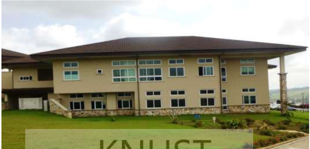
Plate 5: AUC Administration Block