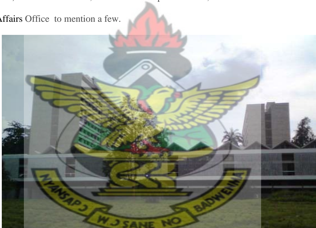
Plate 3: AKNUST Hall of Residence

The KNUST campus has old and modern buildings interspersed with beautiful lawns and tropical flora, which provide favourable atmosphere for learning. Almost all faculties have permanent building complexes containing offices, laboratories, Studios, Lecture Halls and Libraries. Other facilities include the Main Library, Great Hall, Commercial Area, Stadium and Sport Centres, and the Dean of Student's Affairs Office to mention a few.