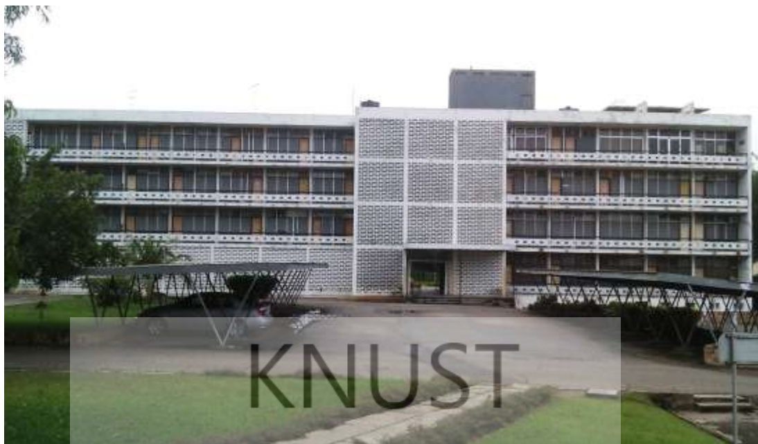
Plate 4: KNUST Main Administration Block

Berekuso which is the new campus and site for Ashesi University is in the Akuapim Hills of the Eastern Region. The Ashesi new campus has traditional architecture; a sequence of courtyards unified with a beautiful landscape of trees, lawns, and stairs that create a natural and peaceful atmosphere for learning. It also has recreational and social buildings. The campus dormitories have been designed to equally support the environment and students of the institution.