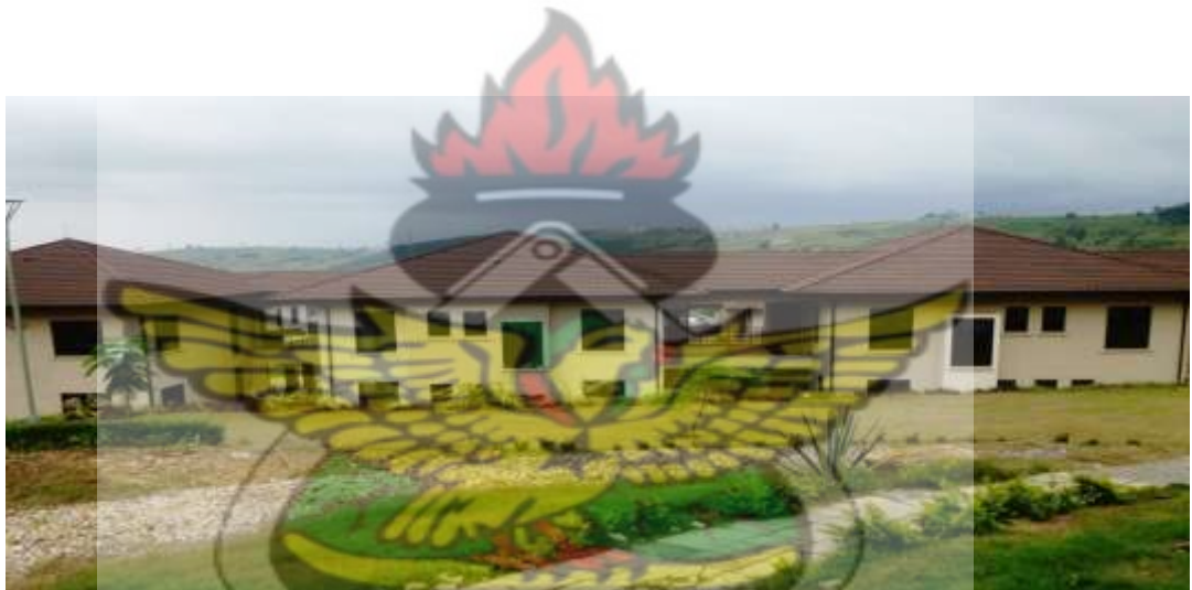
Plate 6: AUC's Hall of Residence