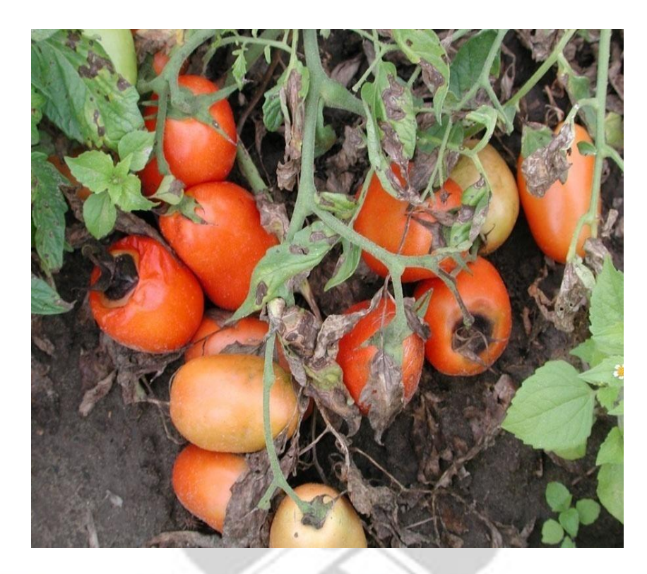
Plate 4: Tomato F1 2026 (most susceptible genotype to Meloidogyne spp. attack) According to Caveness and Ogunforowa (1985), Meloidogyne spp infested-plants are seriously affected by their uptake and transportation of water and nutrients, which in turn affect their shoot weight. Similar observation was made with regard to fresh shoot weight in this study (Table 4.9).

There was a decrease in the shoot weight with an increase in susceptibility to nematodes (Table 4.9). Heavily root-knot nematode-infested plants, according to Sidique and Alam (1987), exhibit stunted growth and declined shoot growth.