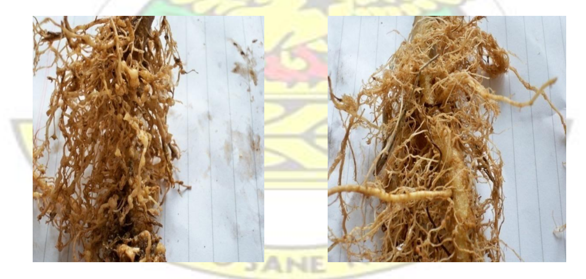
Plate 1: A susceptible tomato genotype, infested with galls

There was significant increase in mean gall score with increase in the inoculum density. The mean gall score ranged from 4.00 to 8.67 for 100 eggs/ tomato plant and 2000eggs/tomato plant, respectively (Table 4.2). There was no significant difference (P=0.05) between the 500eggs/tomato plant and 1000eggs/tomato plant and also between 1500eggs/plant as well as 2000eggs/tomato plant. However, there was significant difference (P=0.05) between the100eggs/tomato plant and all the treatments (Table 4.2 : Plate 1&2).