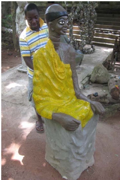
Plate 4.32: Three Quarter View