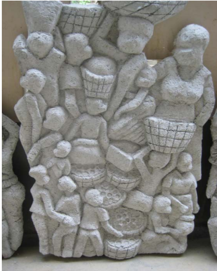
Plate 4.13: Final Cast Piece

The way the figures are placed makes the work very clumsy, and as a result making assessing of proportion of the works very difficult. But the movement of the figures and forms in general create a degree of rhythm.