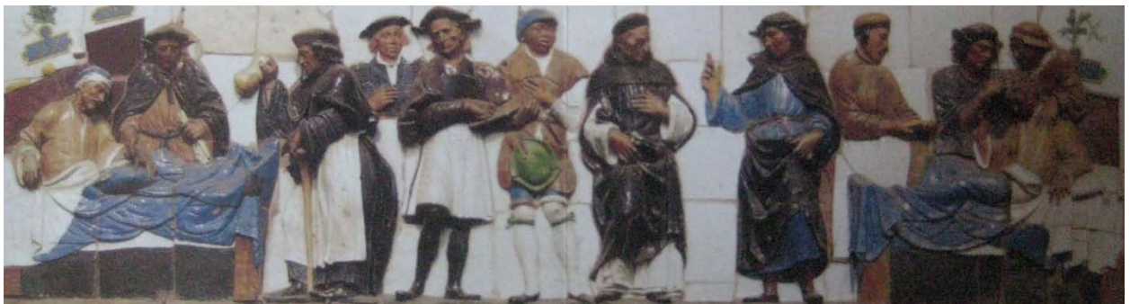
Plate 2.6: Visiting the Sick, from the frieze of the Ospedale del Ceppo, Italy. Painted cement. Della Robbia