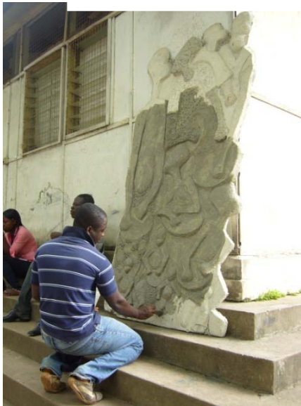
Plate 4.23: Coating Surface of the Work