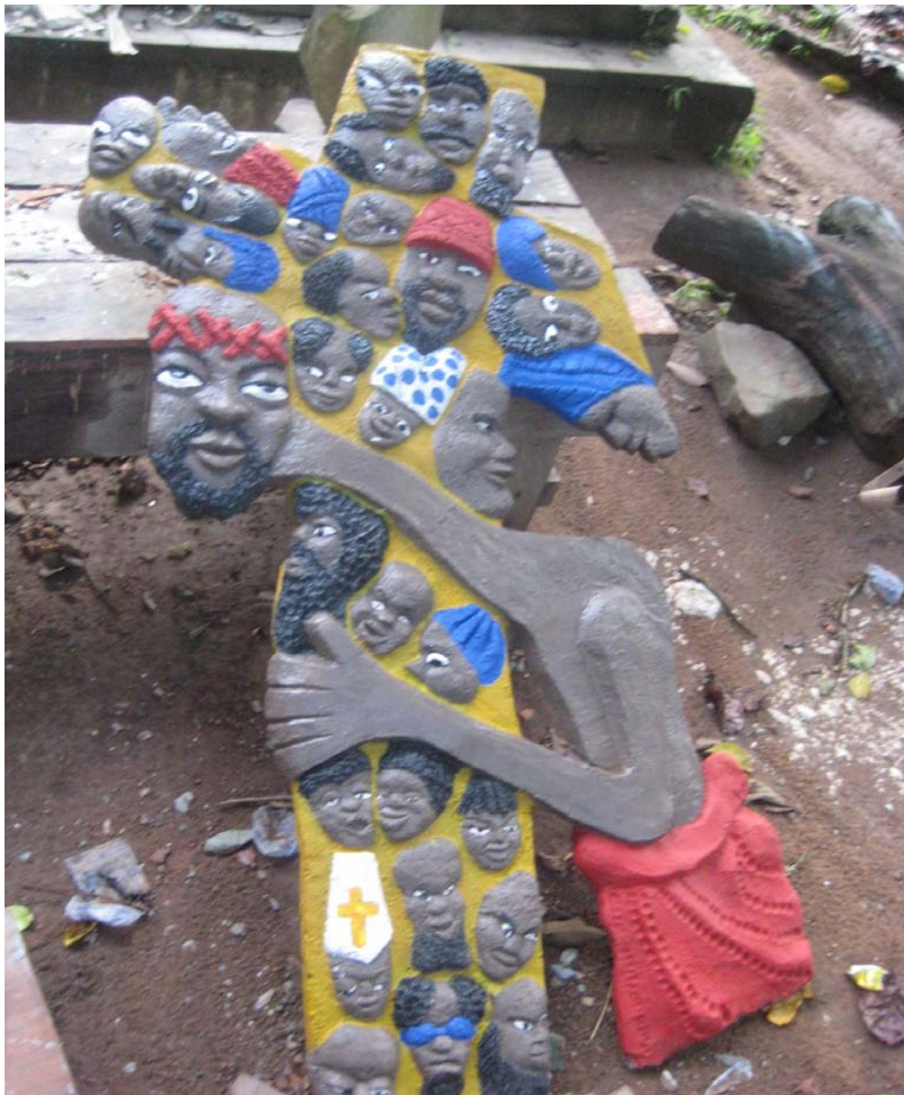
Plate 4.49: Aerial View of “Eternity”

lead good lives on earth and their rewards awaiting them, and also to those on earth who believe that through the carrying of the cross by Christ, they will get eternity someday. The textured surfaces circular and semi-circular, flat and lines seen in the work represent the carrying away of sin which should have been the punishment of mankind which is being borne by Christ.