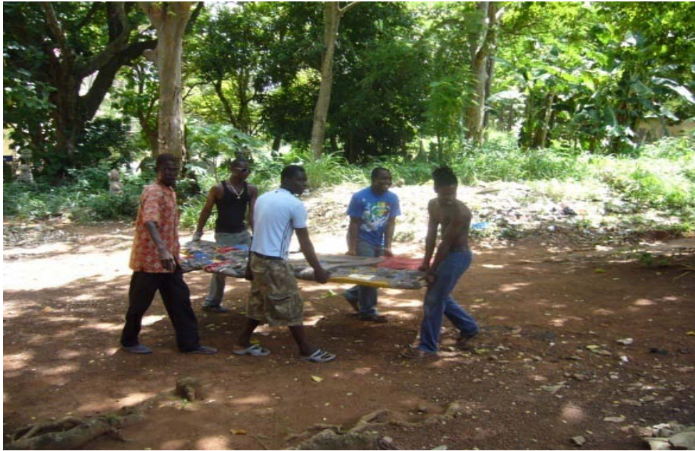
Plate4:48:Lifting of the work “Eternity”