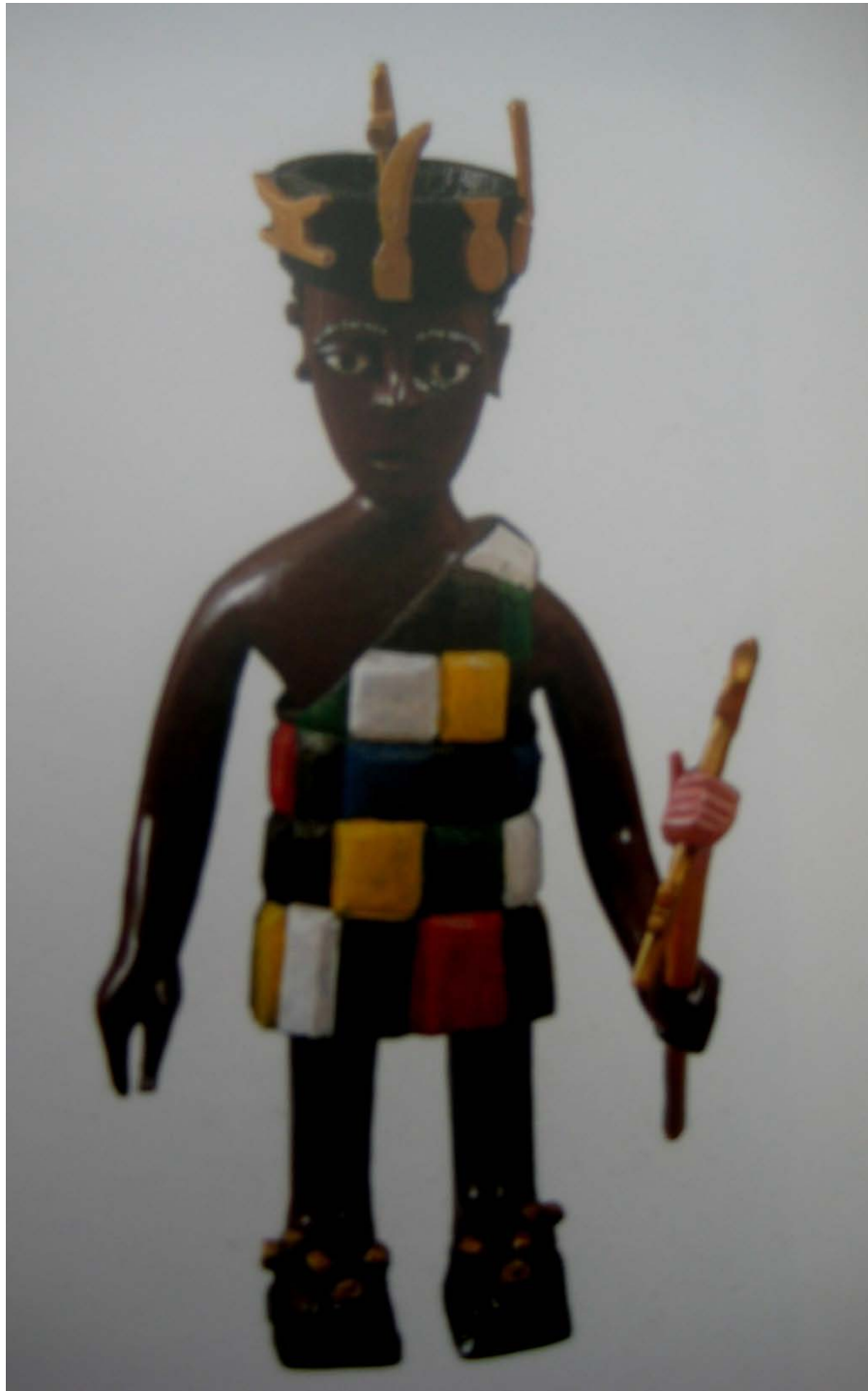
Plate 2.2: The Messenger. Painted wood Agbagli Kossi,Togo(64x29x37 cm)