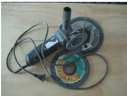
Plate 3.11: Electric Grinder