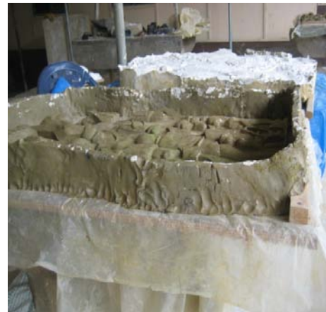
Plate 4.12: Mould taking Stage