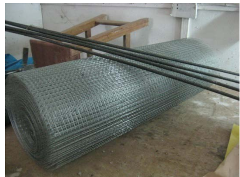
Plates 3.10: Iron Rods and Wire Net