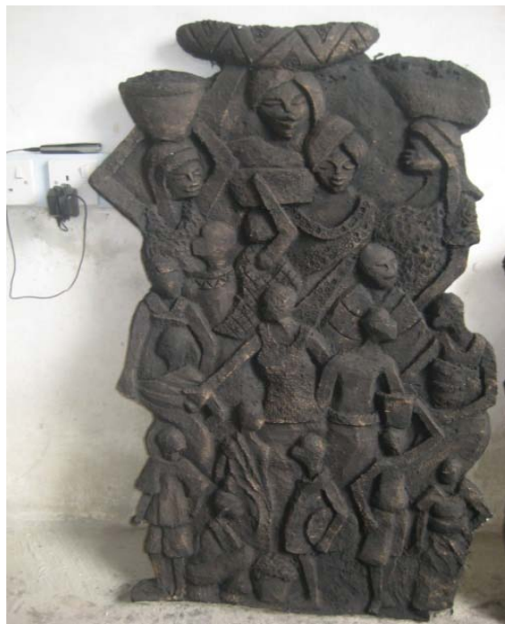
Plate 4.1: Final Work

Preliminary sketches were made for the work and the below sketch was selected out of the whole. A clay bed was prepared for the work and the sketch was made directly from the sketch onto the clay slab and modelling was done with the hands with the aid of a wooden and left for about three hours to dry. The mixture of Papier mâché cement mix was then prepared and a first coat of the mixture was applied in the mould and left also for a day to dry to some extent. The next day, the casting continued with the reinforcement with quarter inch rod and covered with some of the same material to finish the casting. The work was then left for three weeks to dry and with the help of a maul hammer and wooden pegs; the breaking of the mould to release the actual cast work was done. Finishing was then done with brush and acrylic matt paint.