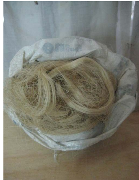
Plate 3.4: Sisal Fibre