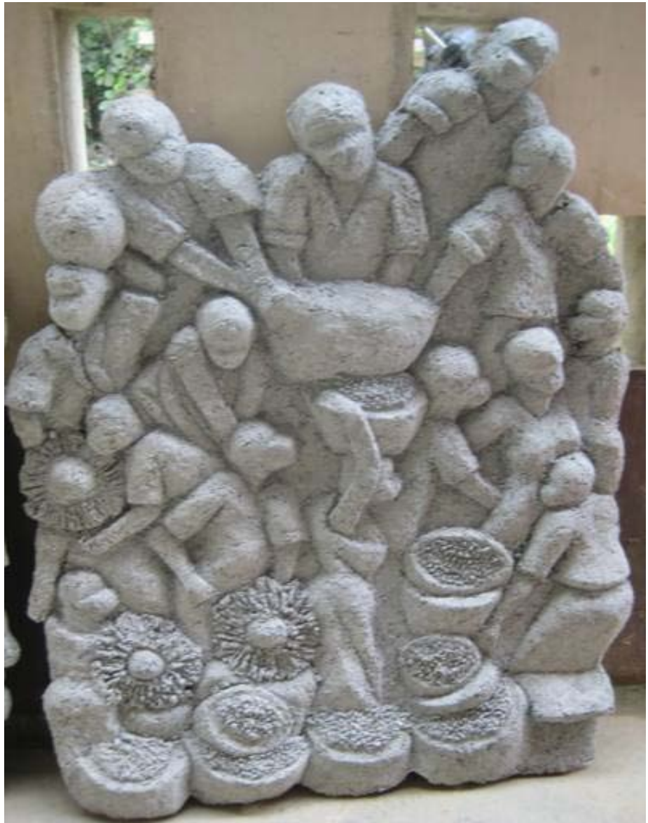
Plate 4.15: Final Cast Piece