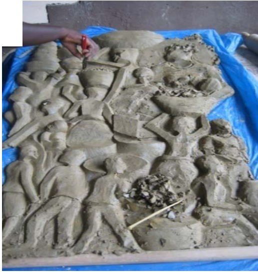
Plate 4.9: During Modelling