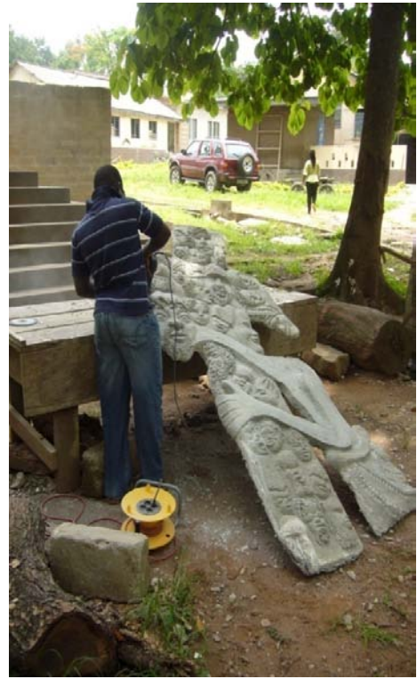
Plate 4.45: Grinding Stage Full View