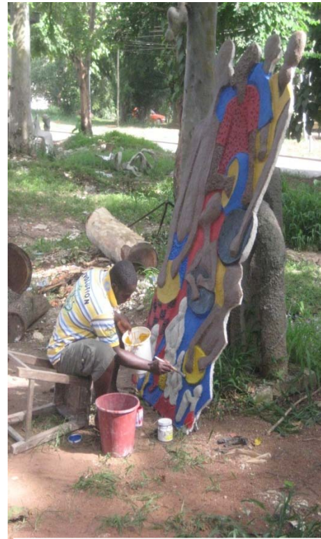
Plate 4.25: Side View of Work during Painting