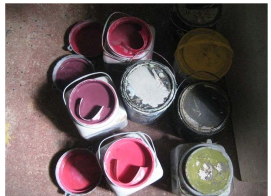
Plate 3.6: Acrylic paints