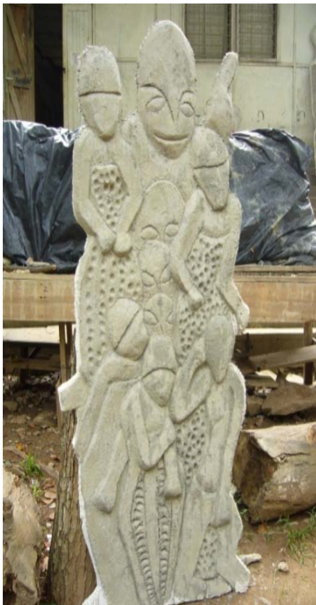
Plate 4.18: Final Work after Modelling

As a chief is enstooled, he becomes the first citizen in that community, it is therefore advisable for him to get people who have been trained to dance for him anytime there is a special event. The dancers have the cloth worn up to the chest level in order to pay homage to their ruler as a sign of respect. The composition is done in a way such that, although there is a repetition of patterns and rhythm, the figures are placed any how to create interesting focal points within the same work. The design pattern of the two dancers also suggests that, they are a special group of the chief and for easy identification.