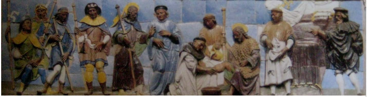
Plate 2.7: Succouring the Pilgrim, from the frieze of the Ospedale del Ceppo, Italy. Painted cement. Della Robbia

The value now centres on imagination above photographic imitation. Lewis further quote;