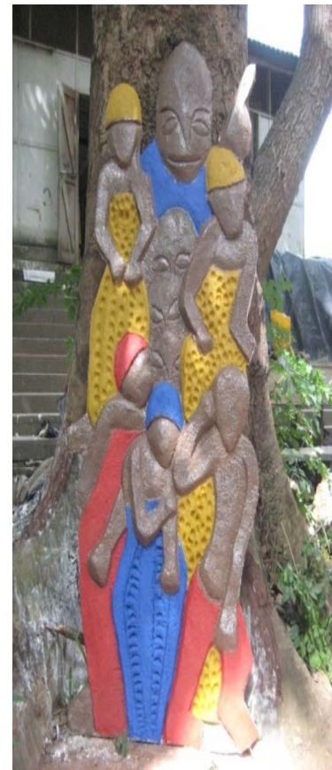
Plate 4.19: Work after Painting