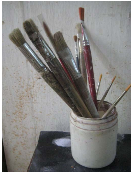
Plate 3.7: Sable and Bristle Brushes