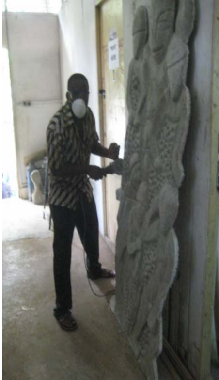
Plate 4.16: Grinding Stage