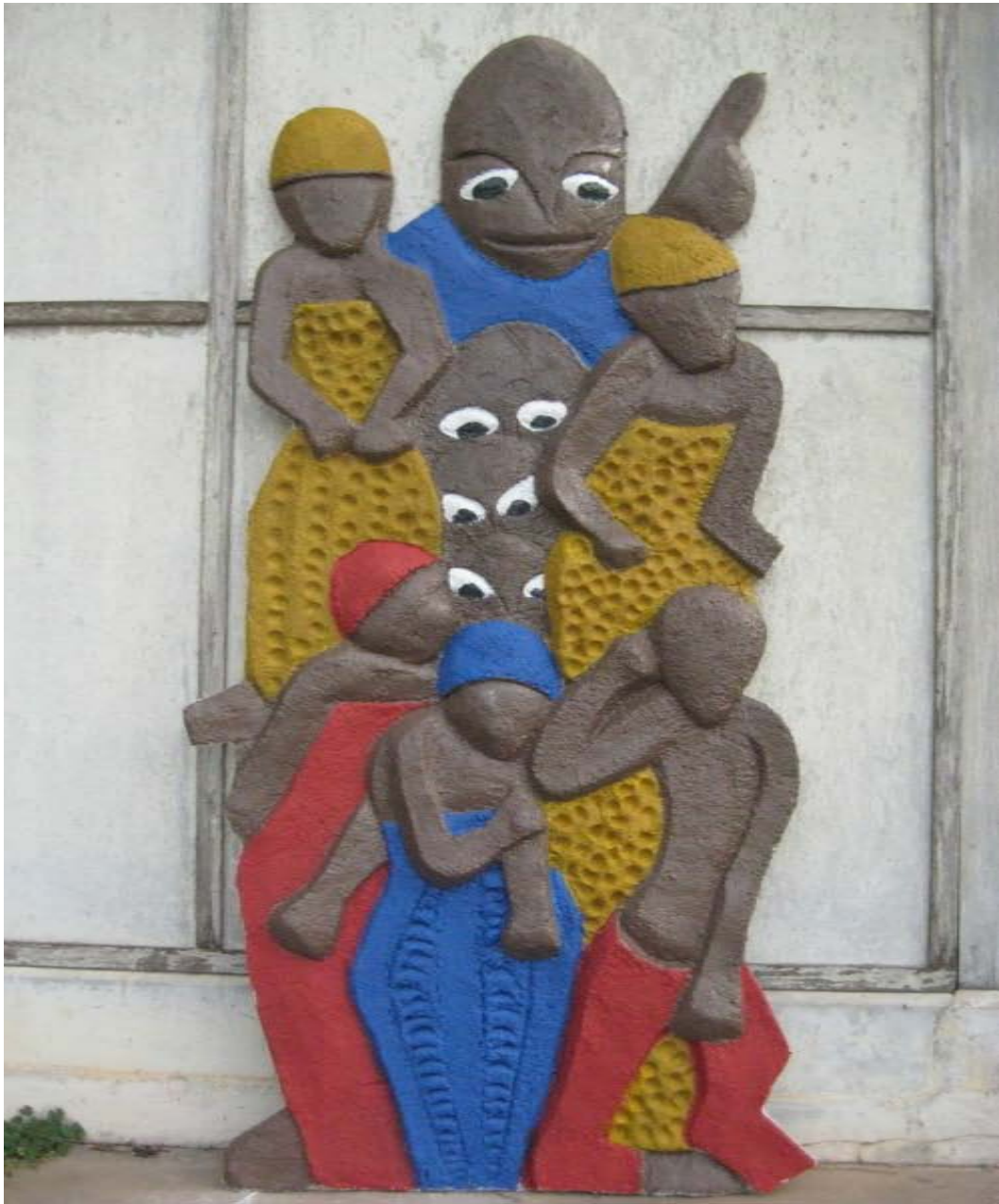
Plate 4.20: Final Work of the Royal Dancers