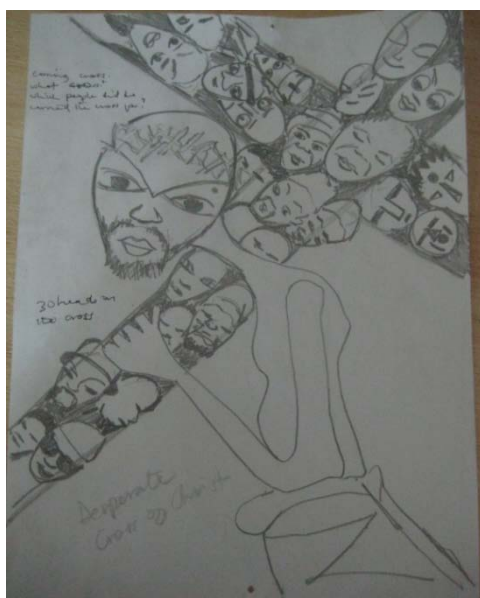
Plate 17.selected sketch