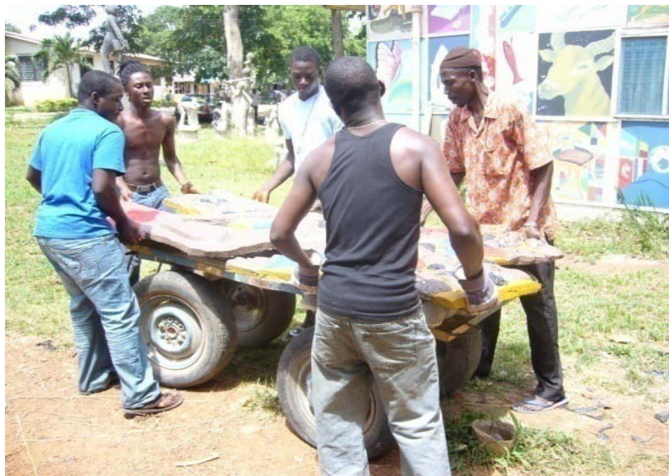
Plate:4:49:Pulling of Work on the Truck