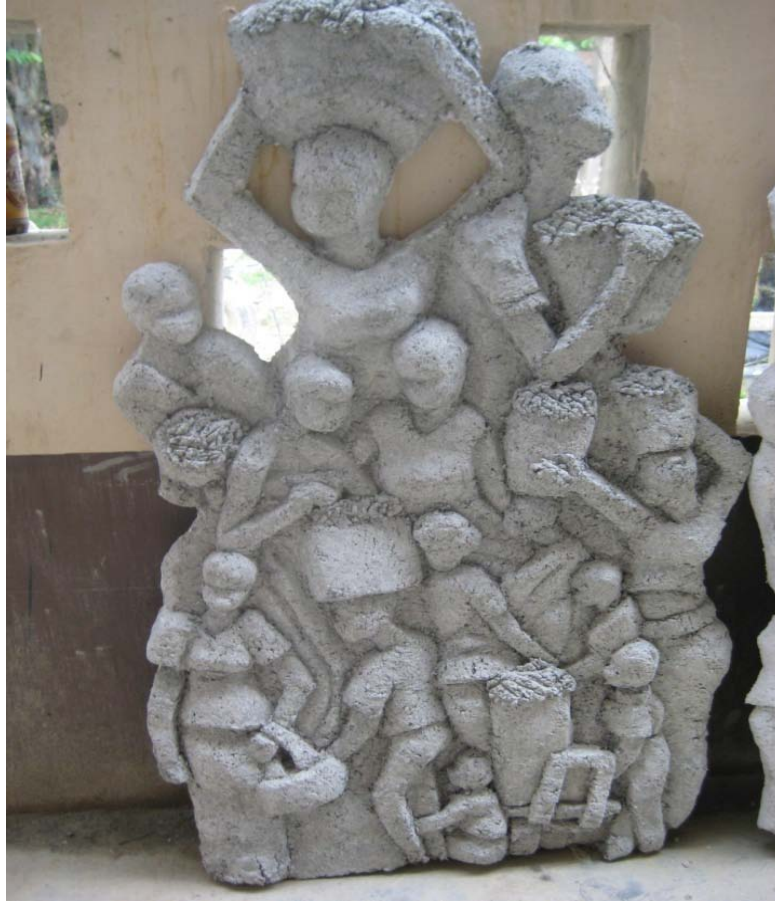
Plate 4.7: Final Cast Piece