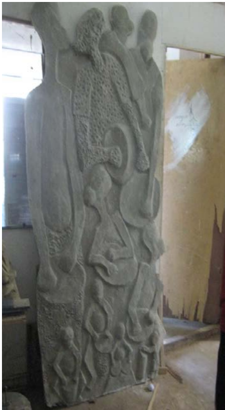
Plate 4.26: Work before Painting