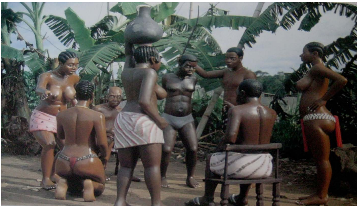
Plate 2.9: The Adultery.1992.Installation, Painted Wood.(200x500x500 cm) Emile