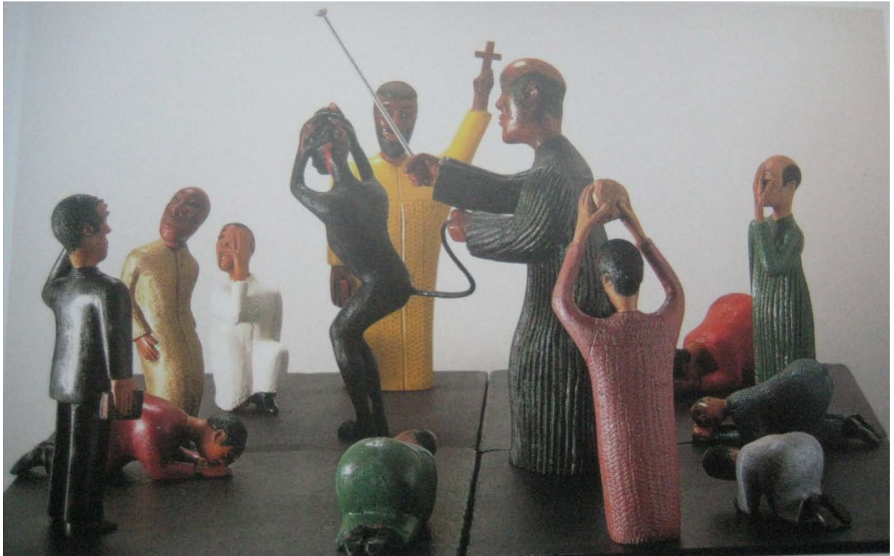
Plate 2.8: Multidenominational Conference.1993.Installation, Carved and Painted Wood.(47x80x80 cm) Johannes Segogela

also paints his works to achieve polychromatic effect which is unusual of sculpture work to create focal point and attention to the viewer. Example of his work is the” the adultery ” (plate 9.p.26).