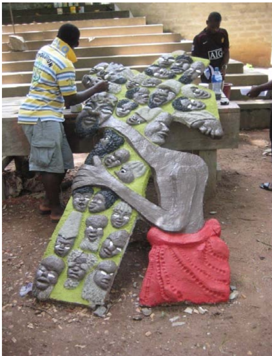
Plate 4.46: Frontal View of “Eternity” during Painting