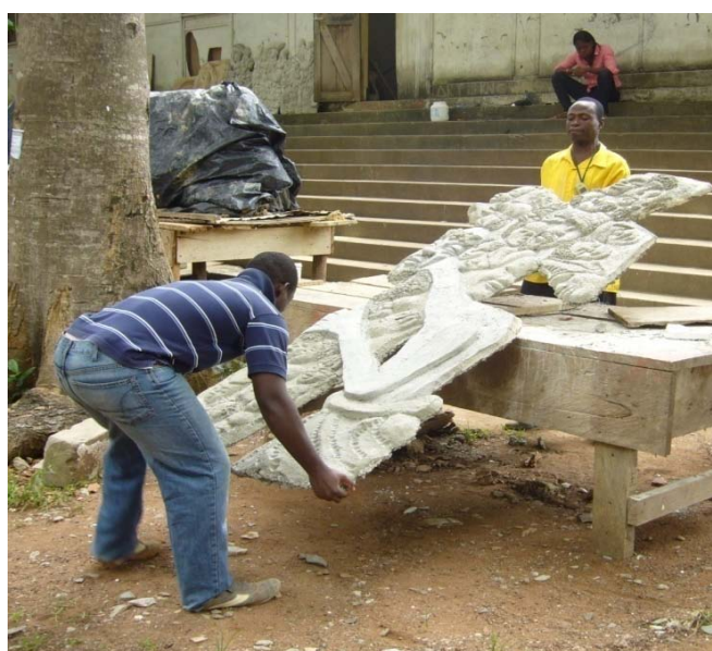
Plate 4.41: Lifting Work for Grinding