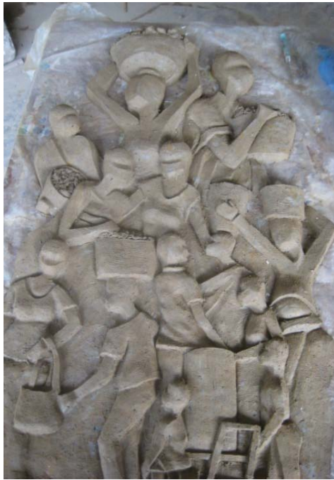
Plate 4.5: Final Clay Work