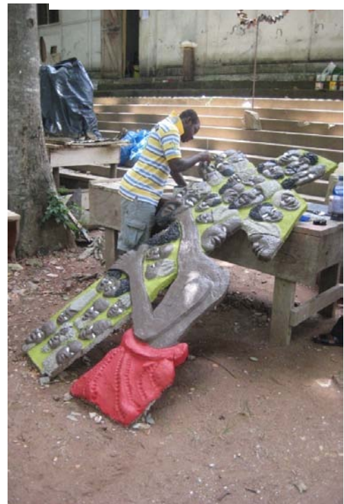
Plate 4.47: Three Quarter View of “Eternity “during Painting