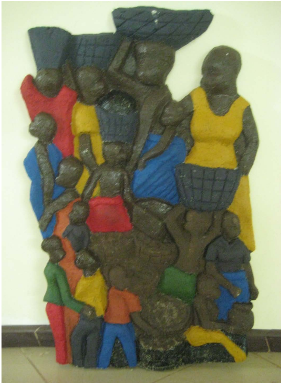
Plate 4.14:Untitled. The finished Piece