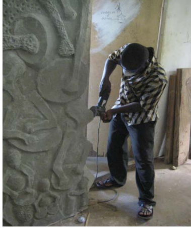
Plate 4.21: Grinding Stage