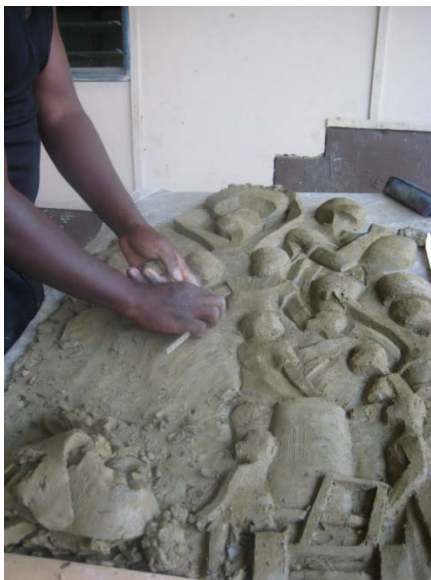
Plate 4.3: Modelling Stage

casting takes place for easy removal of the cast work. The mould was washed and allowed to dry before laminating it for about three times and left again to dry. The mixture of papier mâché and cement mix was prepared in a ratio of 3:4 respectively and stirred to mix thoroughly with a trowel. For the avoidance of air pockets a brush was used to fill the mould bit by bit with the material for the first coat. Iron rods were placed in various parts of the mould to serve as reinforcement after which the mould was fully filled for the casting to complete. The work was left for twenty –five days before it became very hard. With the use of pegs and hammer, the mould was chiselled out to release the work. The work was ground to get the edges of the work sharp and smooth to relieve the work from its background. The work was then painted with acrylic paint as it's finish.