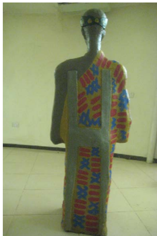
Plate: Back View of the Chief