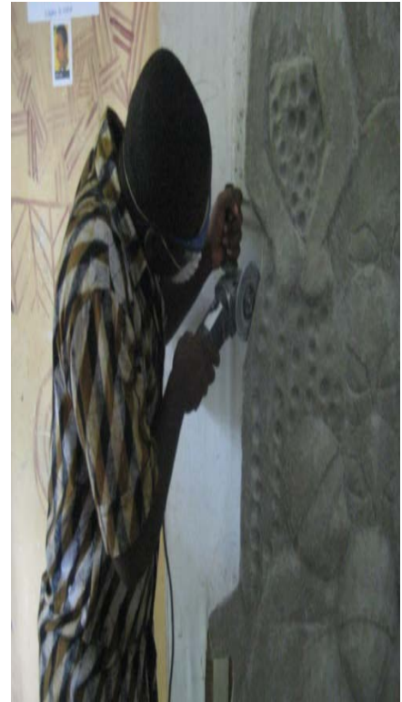
Plate 4.17: Close Up of Grinding Stage