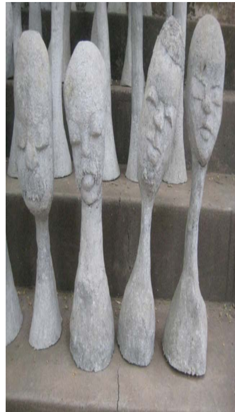
Plate 4.29: Close Up of Heads