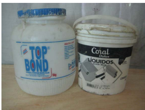
Plate 3.5: White Glue