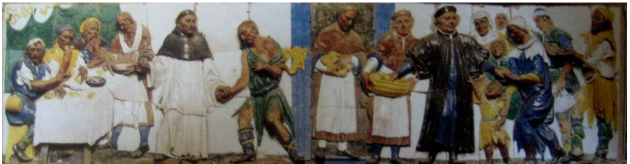
Plate 2.5: Feeding the Hungry, from the frieze of the Ospedale del Ceppo, Italy. Painted cement. Della Robbia

that art is not just skillful imitation. Fortunately there is no more a fixed idea that all pictures should be painted in a naturalistic style and in accurate optical perspective amongst accomplished artists in the world over.