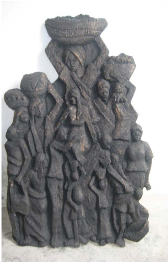
Plate 4.2: Final Work