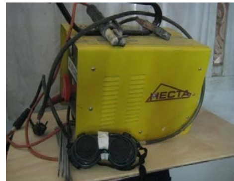
Plate 3.12: Electric Arc-Welding Machine