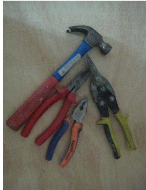
Plate 3.8: Hammer and Cutters