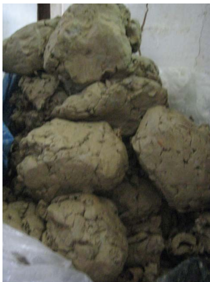
Plate 3.3: Clay