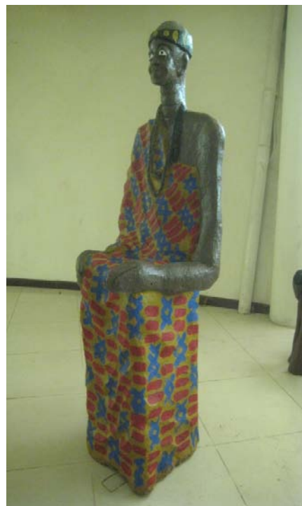
Plate 4.35: Three Quarter View of the Chief