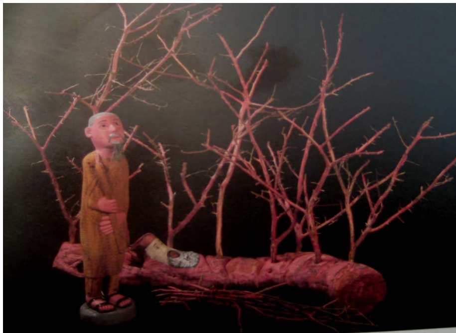
Plate 2.4: Moses and the Burning Bush. 1989. Enamel paint with mixed mediums by Johannes Maswanganyi