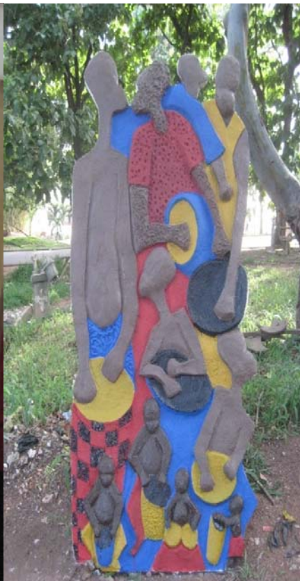
Plate 4.27: Work after Painting