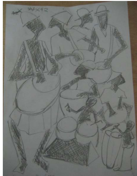
Plate 15: selected sketch for the work