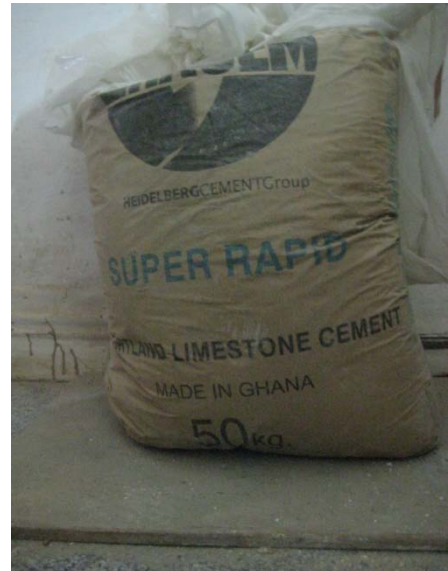
Plate 3.2: Portland cement