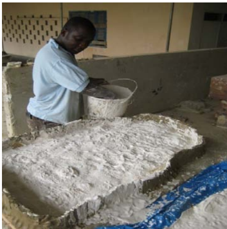
Plate 4.11: Building Clay Wall