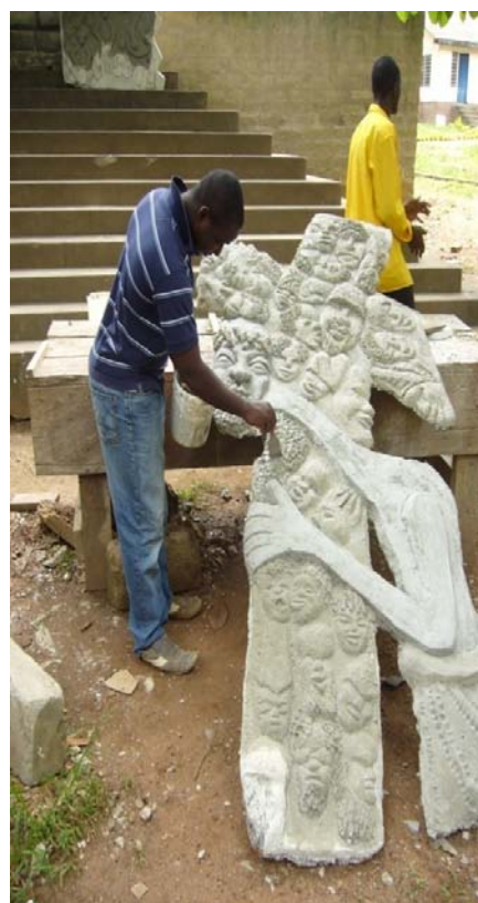
Plate 4.43: Front View of "Eternity"