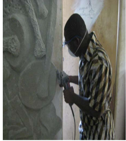
Plate 4.22: Close Up View of the grinding