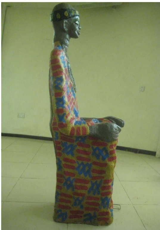
Plate 4.36: Profile of the Chief