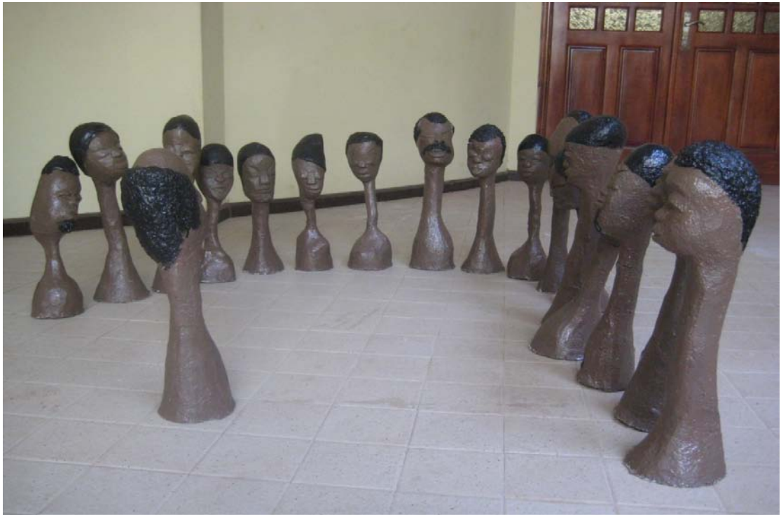
Plate 4.39: Council of Elders in a Meeting at the Palace