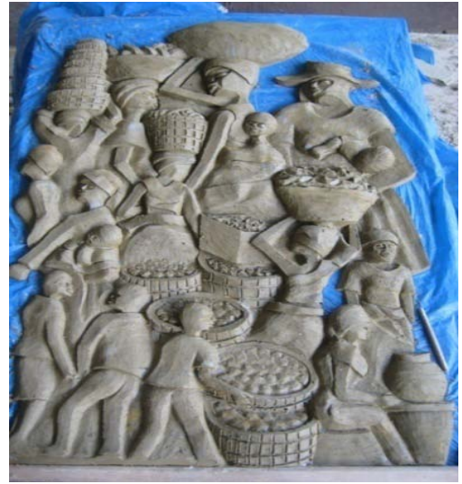
Plate 4.10: Final Clay Work