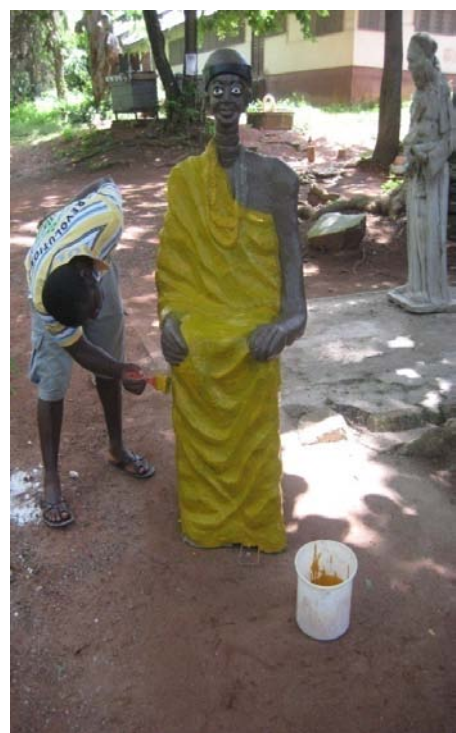
Plate 4.33: Front View of the Chief