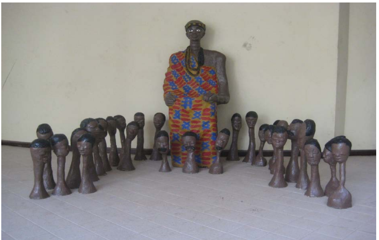
Plate 4.40: The Chief and His Council of Elders at the Palace