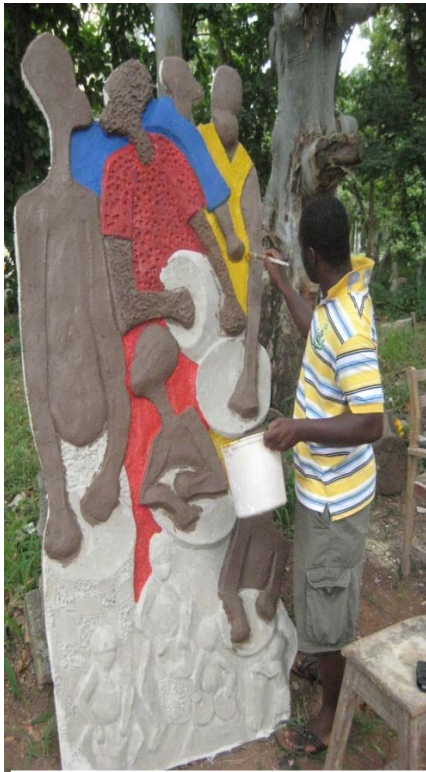
Plate 4.24: During Painting