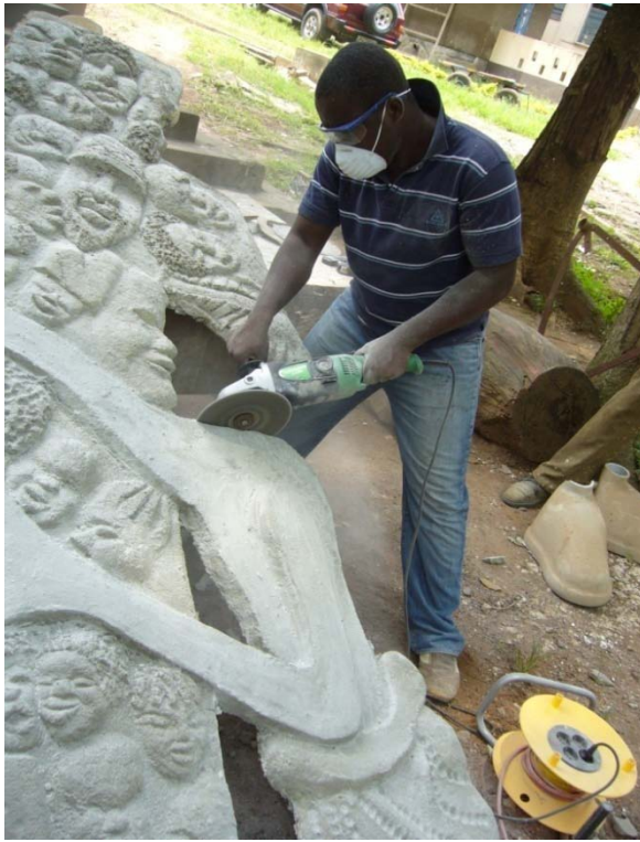
Plate 4.44: Close Up of Grinding Stage