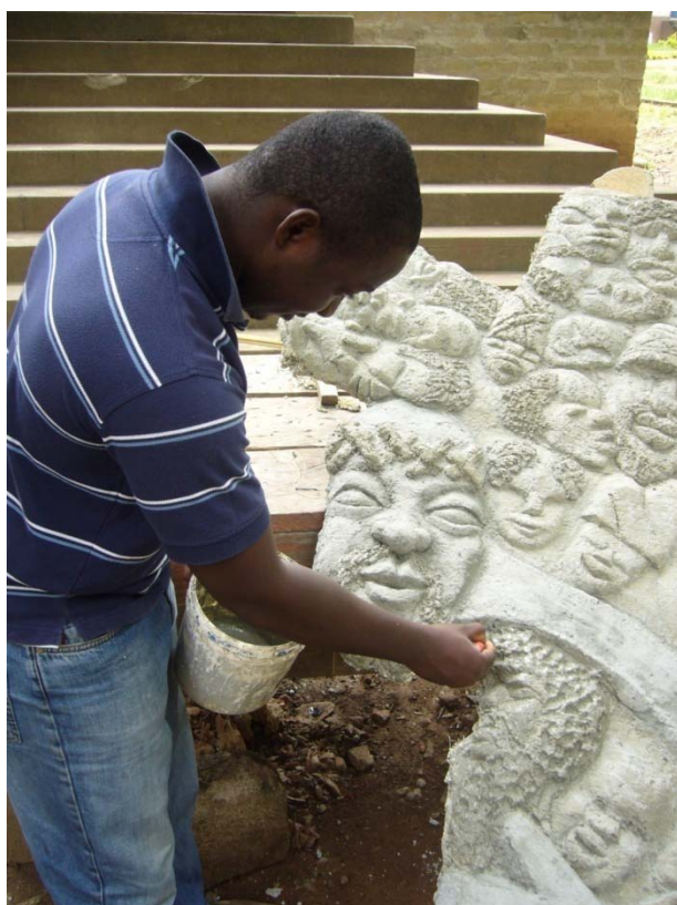
Plate 4.42: Close Up of Work Whiles Coating