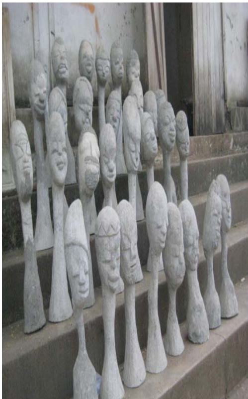
Plate 4.28: The modelled Heads

The profile of the work looks very interesting because, the back of the chief from this view point is almost flat. The back of the chief does not have drapery but has a design of the letter of the alphabet “H” at the back representing the seat he is sitting on. The rest of the seat is part of the body of the chief, the elders around the chief were modelled with different heights. They are different head shapes and styles. All of them have a broad base. Four of them have headgears on with seven of them with hair. The facial characters and expressions differ from one to the other.