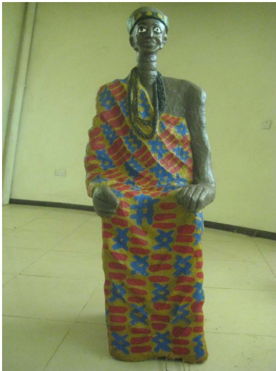
Plate 4.34: Front View of the Chief