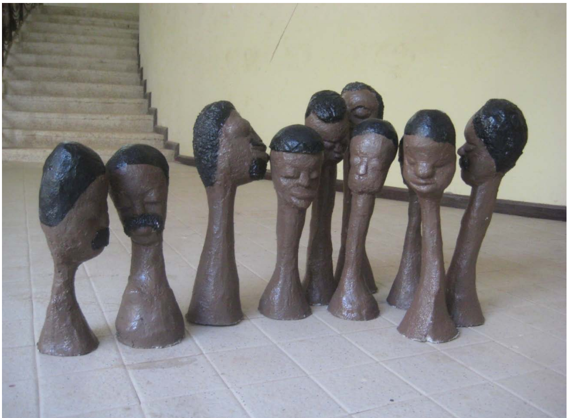
Plate 4.38: Council of Elders Whispering to each other

The elders flanked the chief on both the right and left sides because it is regarded as a form of protection for him. Secondly, any chief who sits in state must be the focal point to the community or any visitor who visits the palace. So the elders form an arc around the chief just to direct viewer's attention solely to the chief who will be in the middle of the said elders, just like the rainbow which attract attention to itself. They are also very close to the chief in order to share ideas before they are voiced out to the community. A new chief decides whether to work with the old council of elders or not. But there are some elders around the throne that the newly enstooled chief can never do away with them. So it makes some of the already existing elders very unstable and that is exhibited through the instability of some elders who flanked the chief.