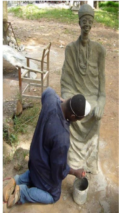
plate 4.32: coating stage