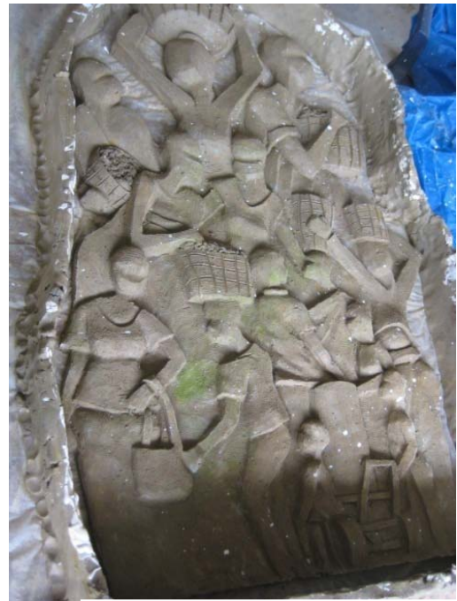
Plate 4.6: Clay Wall around Piece