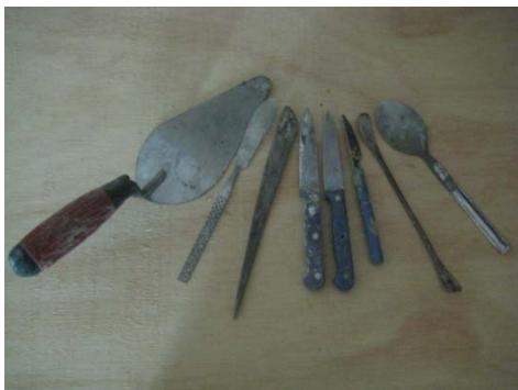
Plate 3.9: Trowel and Modelling Tools