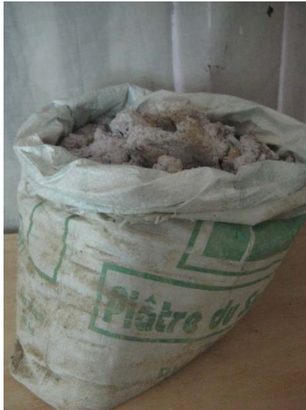
Plate 3.1: Papier Mâché