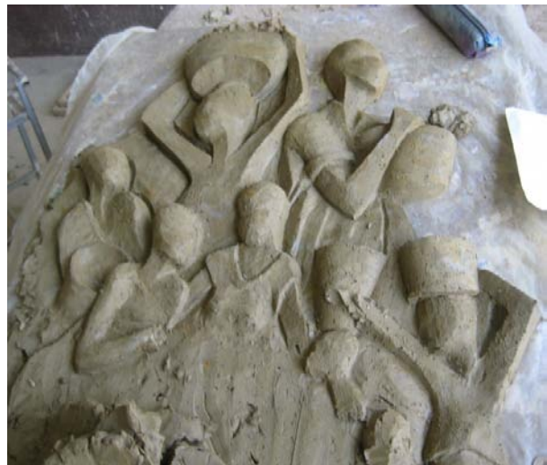
Plate 4.4: Close-Up of Clay Piece