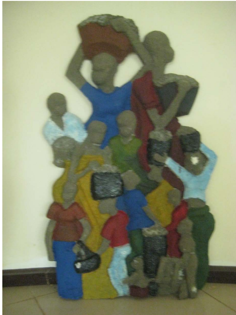
Plate 4.8: Final Work after Painting