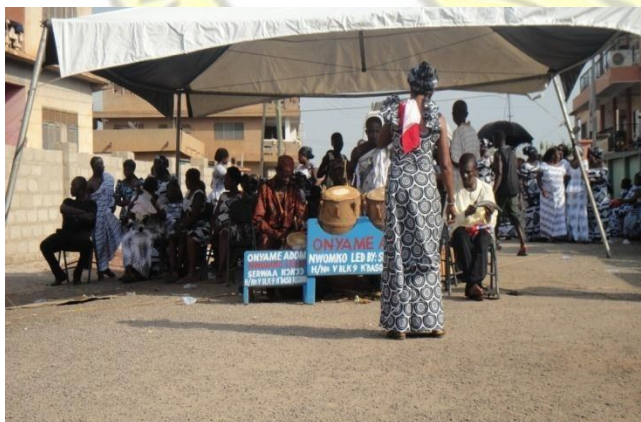
Plate 1: Nwomkorɔ ensemble performing at a funeral at Mampong-Daaho.