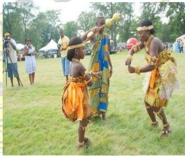
A child dancing to adowa performance: A group dancing to adowa song. Retrieved