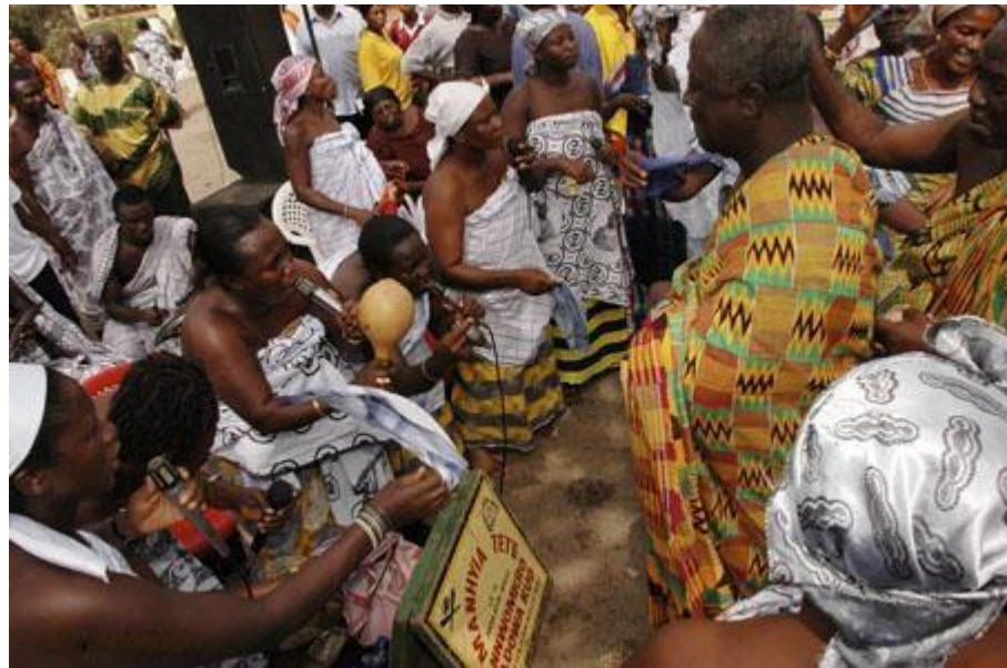
An adowa ensemble at performance.