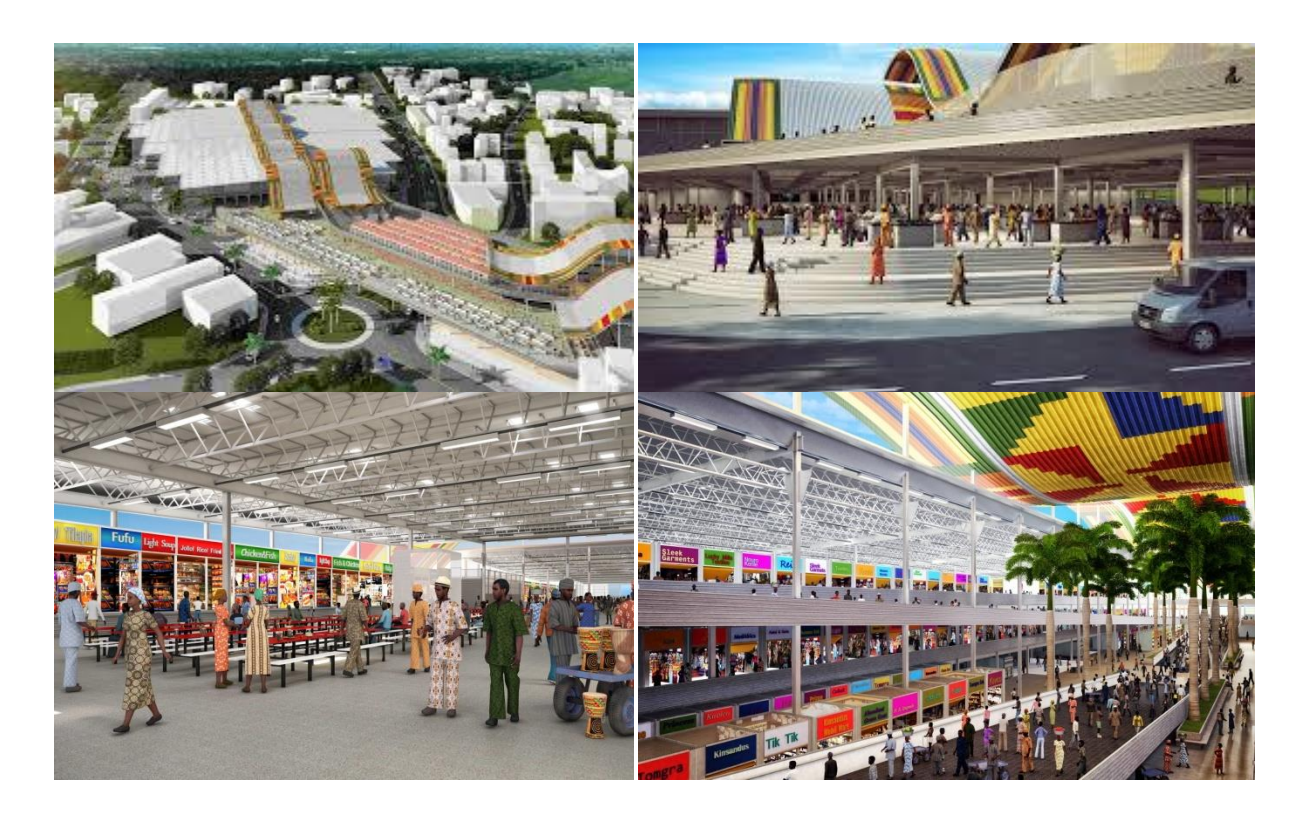
Figure 4.1: Proposed Kejetia/Central Market Redevelopment Project

The main source of fund for the project is a loan claimed from the French government for US$298 million. Thus, the project manager indicated that the source of funding was from the Government of Ghana. The project is expected to last over 3 years with the phase-one involving the re-construction of the Kejetia Terminal and building of 10,000 stores. The second and third phases entail the renovation of the Central Market, which is to be done in two parts. As already indicated the construction company is Brazilian thus corroborating the response from the project manager that it is from outside Ghana. The project manager also indicated that the project is made up of 201-300 employees, which is a substantial contribution to the workers with some from Ghana.