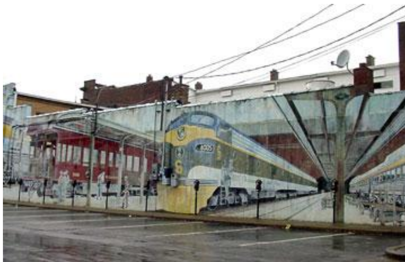
Plate 2: Trains (1989)