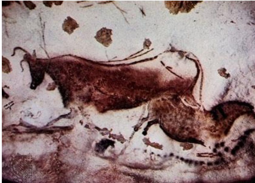
Plate 1: Cave painting of a bull and a horse in Lascaux Grotto, France.