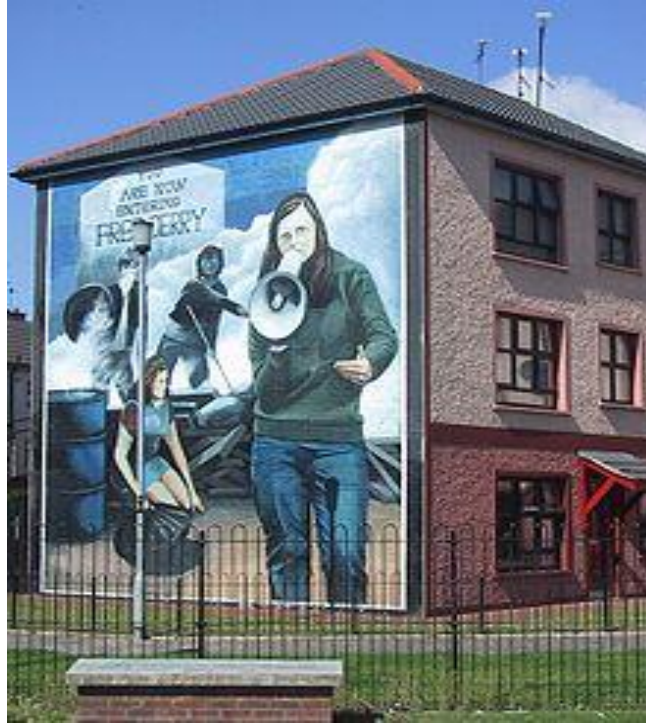
Plate 4: An Irish republican mural