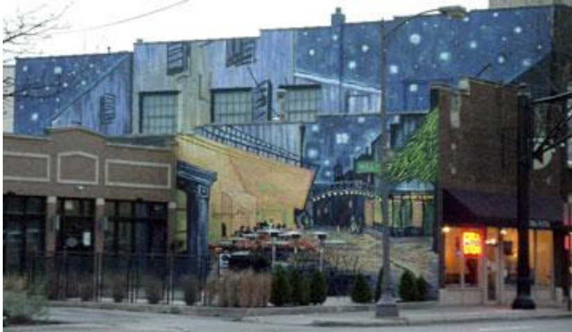
Plate 3: Van Gogh's Café Terrace at Night (2003).