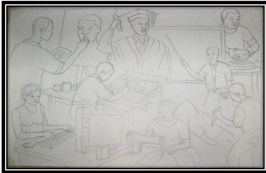
Plate 15: Design of Prospects in the Arts mural

discuss the content and seek to have art taught in the schools. The first site was a wall of the S. D. A. Primary School block, with the second, the front fence wall of the Konadu Yiadom Senior High School. These two sites were intentionally chosen due to their strategic locations in the centre of the town and also their nearness to the main road. The mural selected for the S.D.A. school wall showed a teacher and two students, a sculptor, a secretary, a headmistress and a university graduate. The second mural illustrated a painter, a potter, a weaver, a textile designer, an architect and a university graduate. Both murals were meant to be executed on the school premises so that they could serve as reference materials and resources for teaching and learning and at the same time, for the beautification of the schools' environment and the community as well.