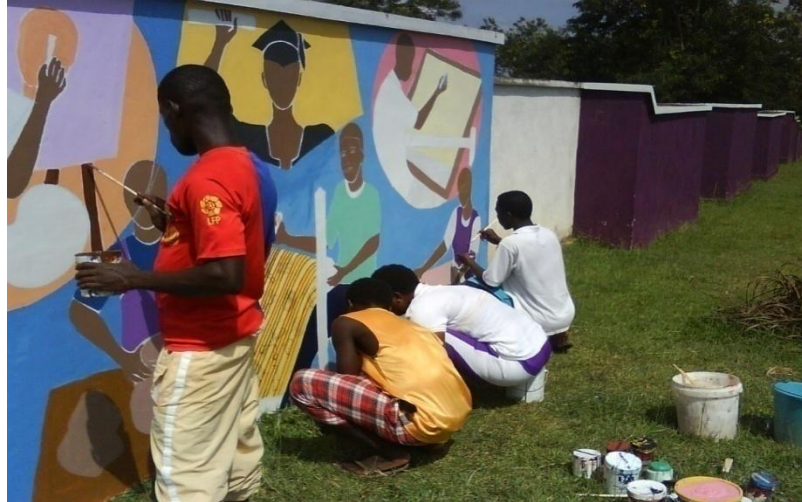
Plate 27: Students putting finishing touches to Mural Project Two