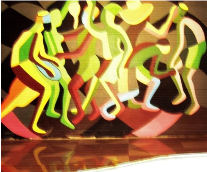
Plate 6: Semi-abstract mural near the Porter's Lodge of Republic Hall, KNUST