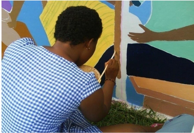
Plate 29: Close-up of student performing assigned task