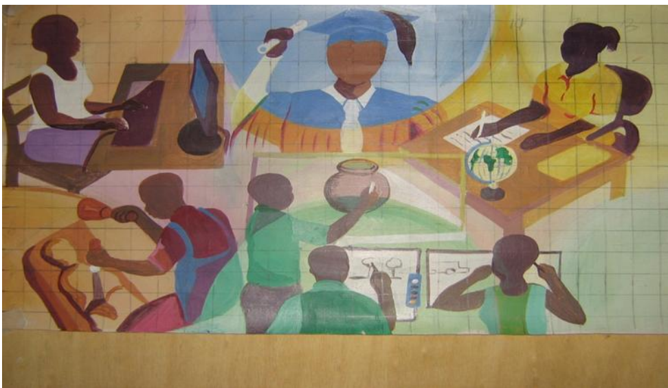
Plate 18: Initial scaling and painting of final sketch for Mural Project One

The finishing was done with the use of small type brushes to bring out the outlines and details of all the images in the work.