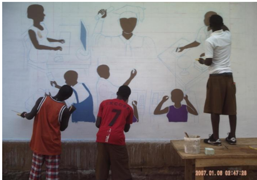
Plate 20: Students working on Mural Project One