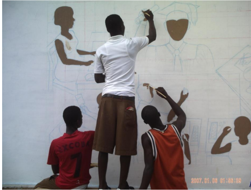
Plate 19: Students painting the sketch of Mural Project One