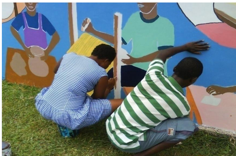
Plate 28: Close-up view of students executing Mural Project Two