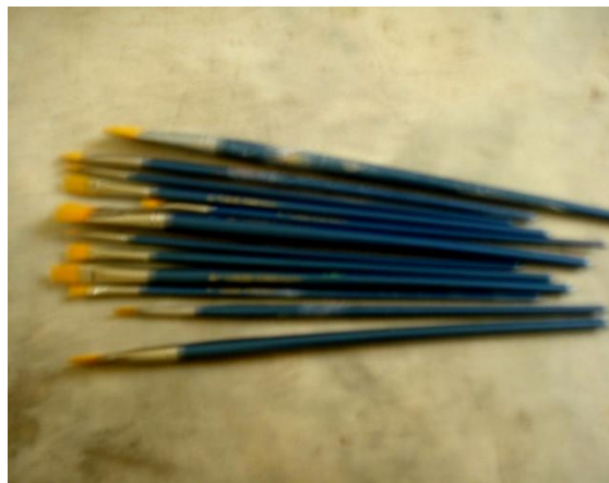
Plate 9: Small size brushes