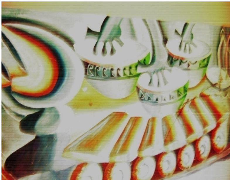
Plate 7: Semi-abstract mural in Republic Hall, KNUST