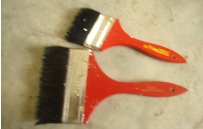
Plate 10: Large size brushes