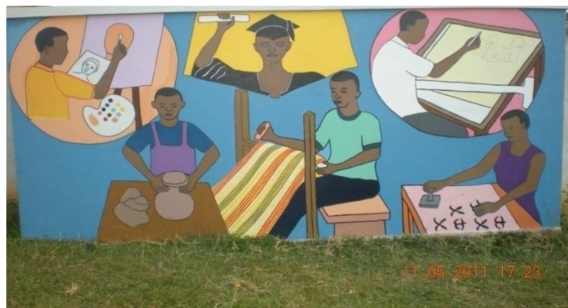
Plate 30: Finished sample of Project Two