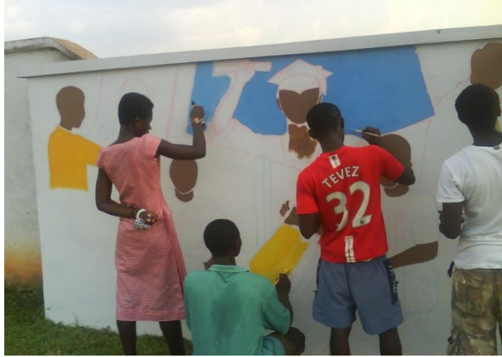
Plate 25: Students painting Project Two