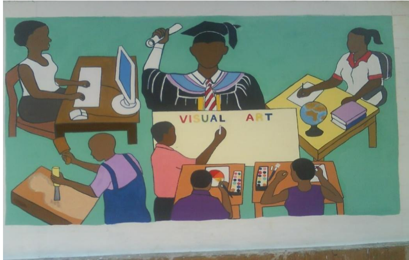
Plate 23: Finished sample of Mural Project One