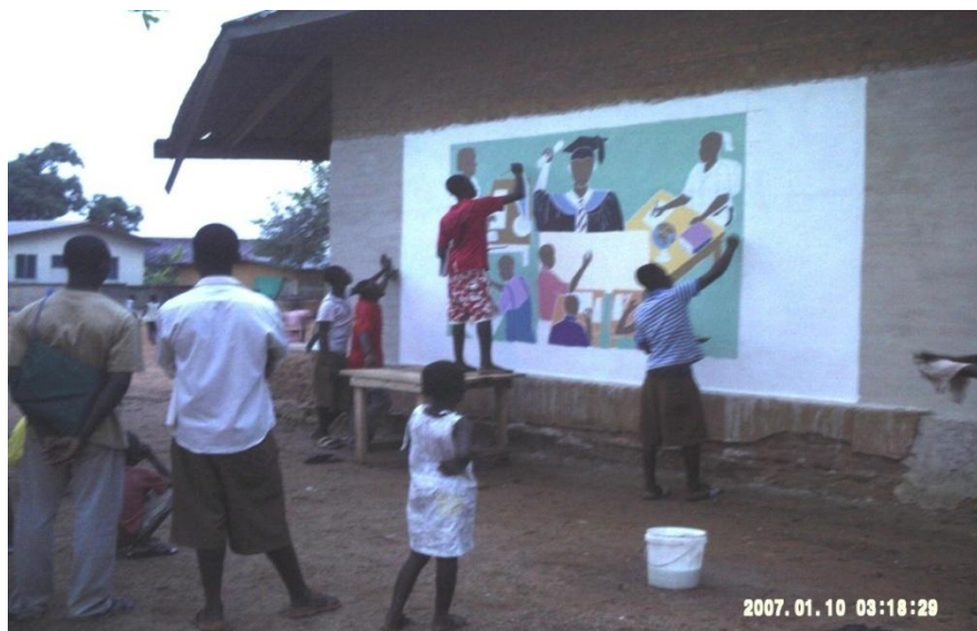
Plate 21: Project execution attracts public attention