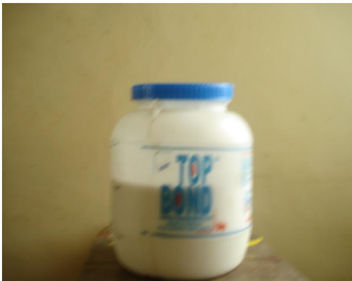
Plate 11: White Glue