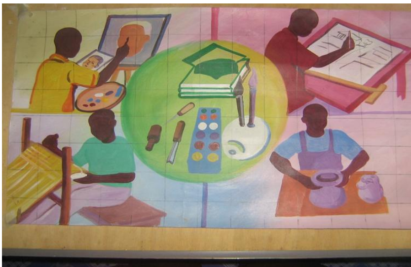
Plate 24: Initial scaling and painting of final sketch for Mural Project Two