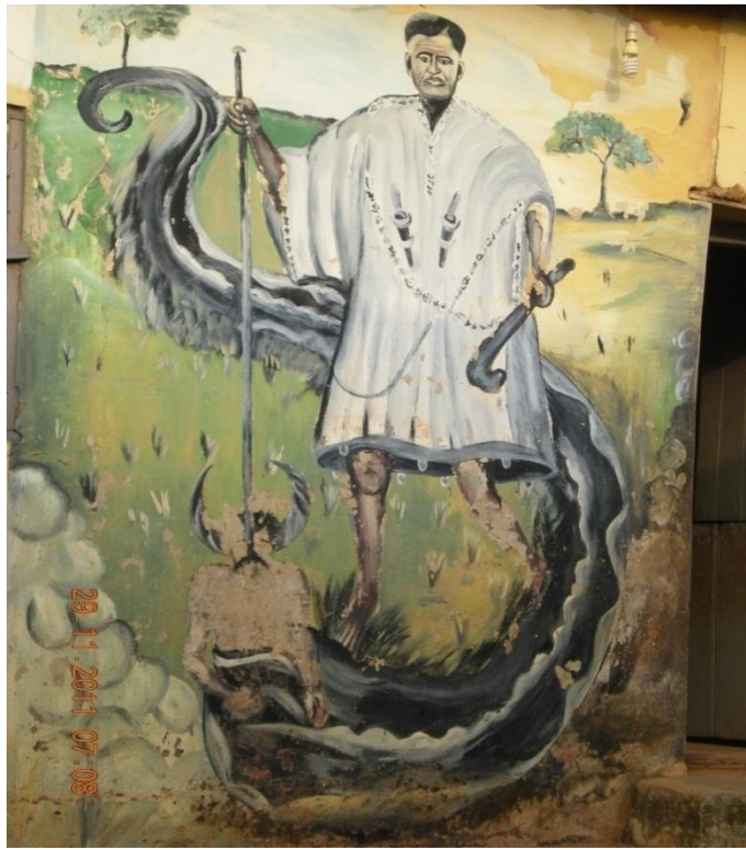
Plate 8: Realistic painting mural at a shrine in Asamang