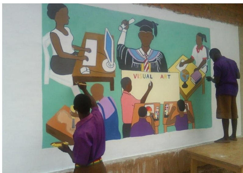
Plate 22: Students putting finishing touches on Mural Project One