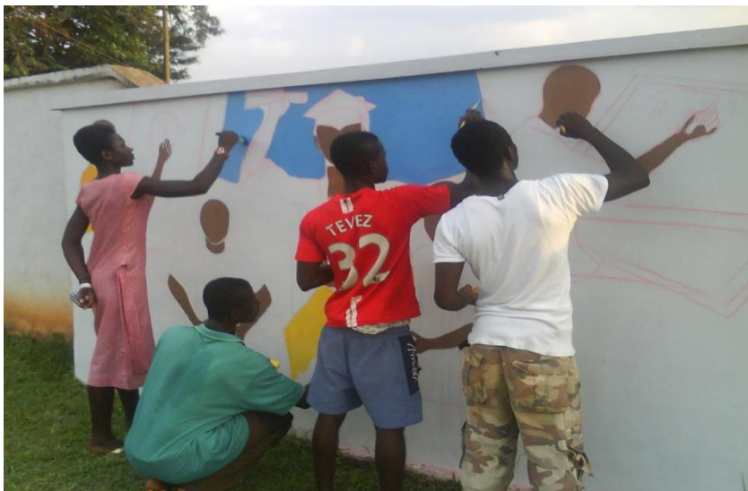
Plate 26: Students given portions to paint for team work