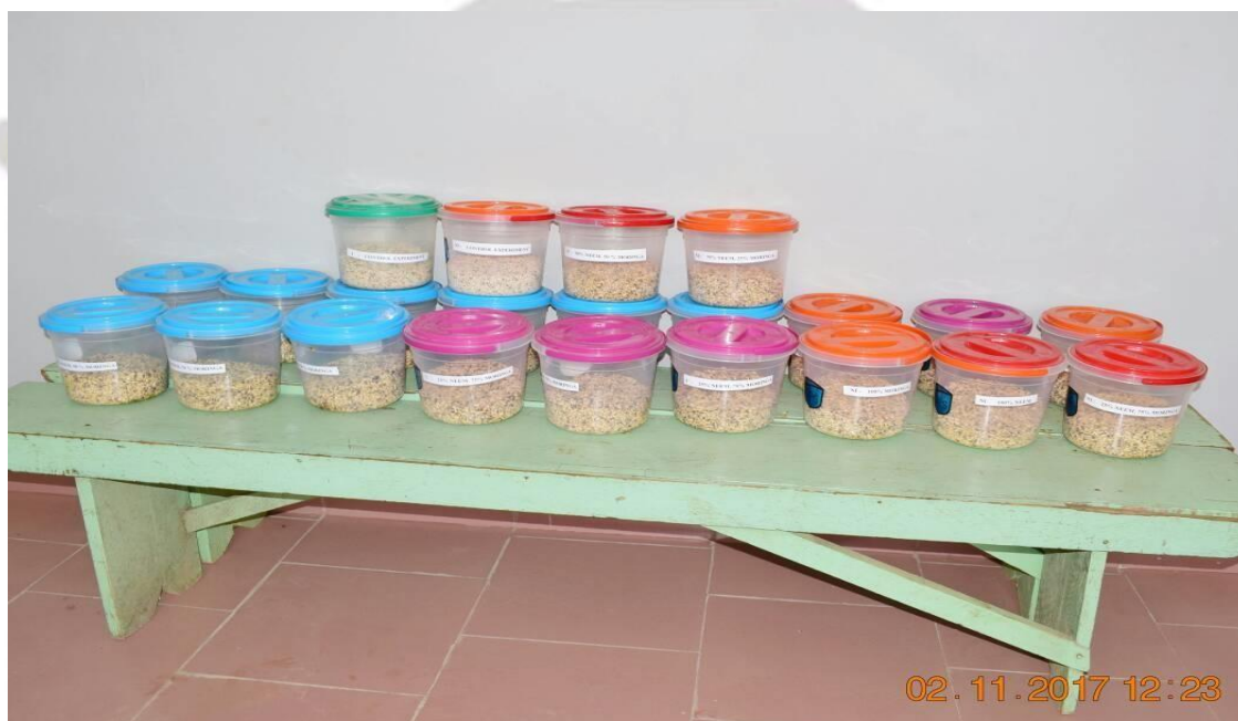
Plate 3.1: A picture showing experimental set up

Experimental set up were done for non-infested seeds. Each treatment consisted of 1kg of cowpea seeds. The weighed seeds were placed in plastic containers and about 25 ml of the treatment oil was pipetted into the weighed seed samples according to the proportions in Table 3.1 except for the control where no oil was applied. The mixtures were vigorously shaken to ensure uniform mixing of the oil and the seeds. About 20 adult weevils were then introduced in each container of cowpea. The containers were covered with a cheese cloth to allow for exchange of gases between the content in the container and the environment. The treatments were then stored at ambient conditions in a storage environment. Plate 3.1 shows the experimental set up of the treatment.